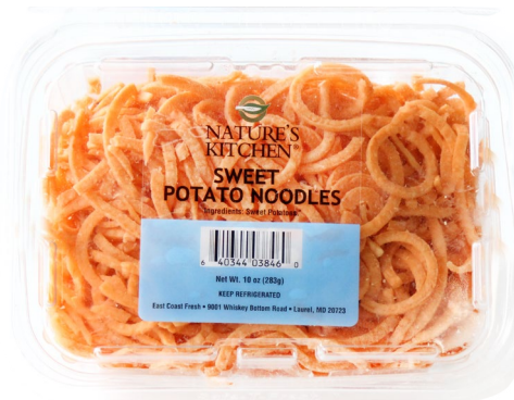
CV Sweet Potato Spiral Cut Noodles

CODE: 08817 PK/SZ: 6/10 oz UPC: 6 40344 03770 8