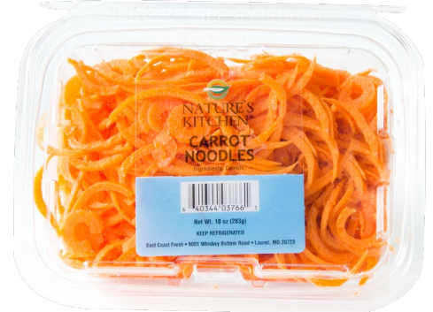
CV Carrot Spiral Cut Noodles

CODE: 08815 PK/SZ: 6/10 oz UPC: 6 40344 03848 4