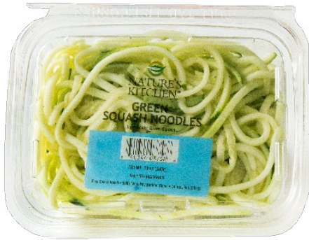
CV Green Squash Spiral Cut Noodles

CODE: 08814 PK/SZ: 6/10 oz UPC: 6 40344 03758 6