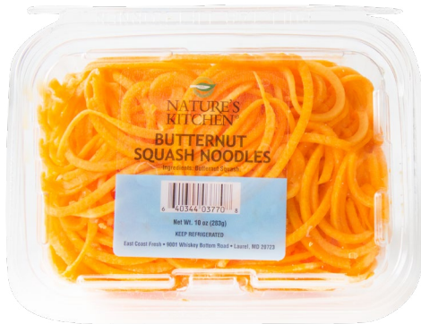
CV Butternut Squash Spiral Cut Noodles

CODE: 08816 PK/SZ: 6/10 oz UPC: 6 40344 03766 1