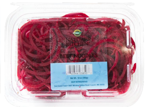
CV Red Beet Spiral Cut Noodles

CODE: 08818 PK/SZ: 6/10 oz UPC: 6 40344 03846 0