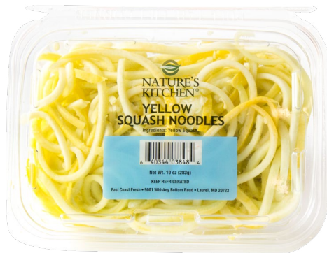
CV Yellow Squash Spiral Cut Noodles

CODE: 08814 PK/SZ: 6/10 oz UPC: 6 40344 03758 6