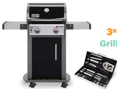
3RD PLACE Grill & Grill Set