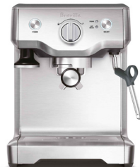
2ND PLACE Breville Espresso Maker