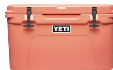
5TH PLACE YETI Cooler

**Every entry will receive a Sunkist hat!**