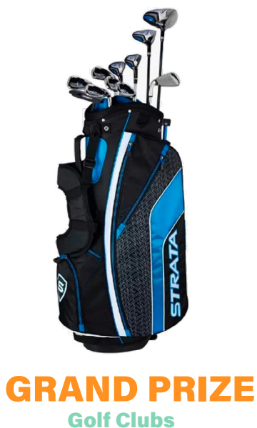
GRAND PRIZE Golf Clubs

(DISPLAYS WILL BE JUDGED OFF OF CREATIVITY, USE OF SUNKIST SIGNAGE/BINS, AND OVERALL EYE APPEAL)