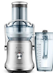
4TH PLACE Breville Juicer