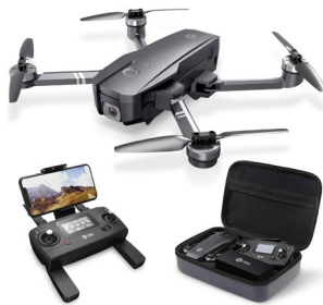
2ND PLACE DRONE PACKAGE