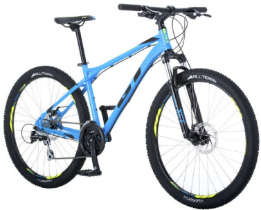
1ST PLACE MOUNTAIN BIKE

(DISPLAYS WILL BE JUDGED OFF OF CREATIVITY, USE OF SUNKIST SIGNAGE/BINS, AND OVERALL EYE APPEAL)