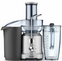
5TH PLACE BREVILLE JUICER