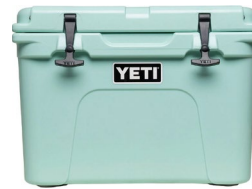
3RD PLACE YETI COOLER