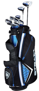
4TH PLACE GOLF CLUBS