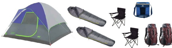
BEST ORGANIC DISPLAY 1ST PLACE CAMPING PACKAGE