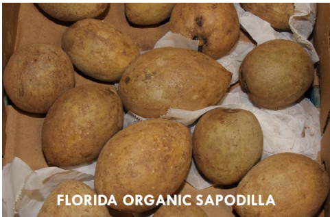
FLORIDA ORGANIC SAPODILLA

Organic Cucumbers, Zucchini, and Yellow Squash from Mexico have steady availability, but supplies are generally tighter in early February and as a result we have experienced increased prices into February. Quality has remained strong as supply volumes have declined.