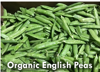
Organic English Peas