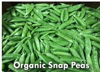
Organic Snap Peas