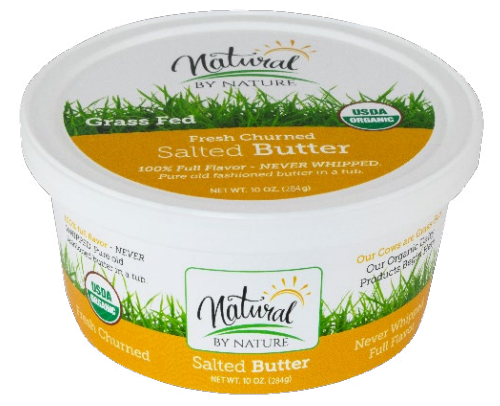
Code: 45811 Organic Natural by Nature Salted Butter Tub 12/10 oz