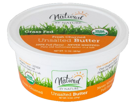
Code: 45810 Organic Natural by Nature Unsalted Butter Tub 12/10 oz