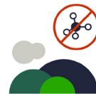
Reduced Landfill Methane