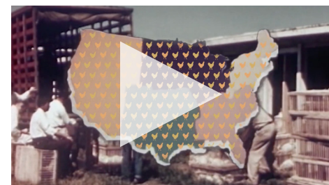
The Untold Story of Chicken