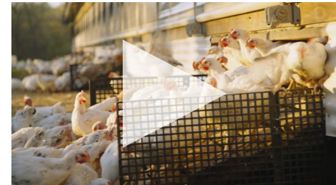
What Pasture-Raised Means at Cooks Venture