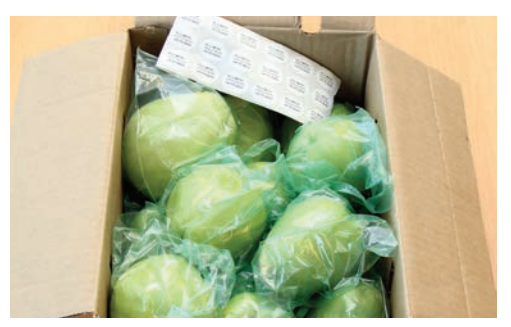
Chayote Squash w/ PLU SIZE: 10 lb. CODE: 17120 PLU: 4761