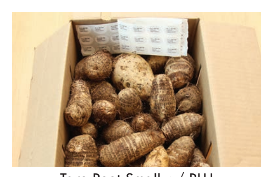
Taro Root Small w/ PLU SIZE: 10 lb. CODE: 01440 PLU: 4794