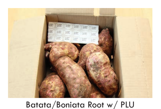
SIZE: 10 lb. CODE: 01499 PLU: 4546