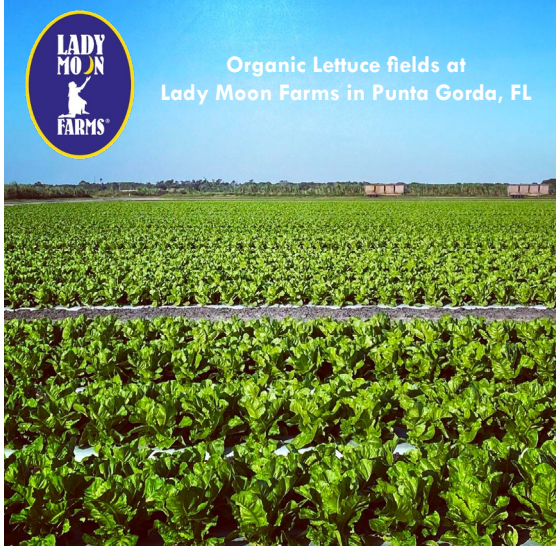
Organic Lettuce fields at Lady Moon Farms in Punta Gorda, FL