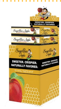
CODE: 226286 POS Display Pop Up Bin #2