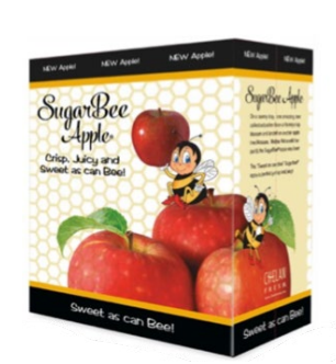
CODE: 223135 POS Display Pop Up Bin #1