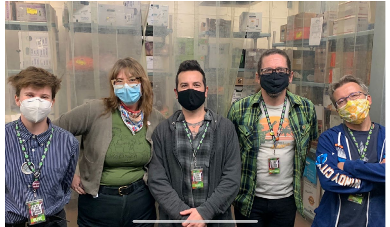
EAST END COOP