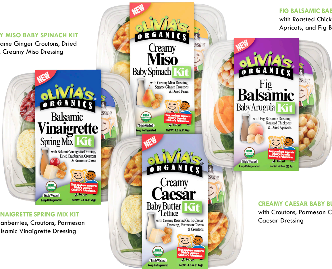
FIG BALSAMIC BABY ARUGULA KIT with Roasted Chickpeas, Dried Apricots, and Fig Balsamic Dressing

BALSAMIC VINAIGRETTE SPRING MIX KIT with Dried Cranberries, Croutons, Parmesan Cheese, & Balsamic Vinaigrette Dressing