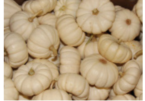
214521 WHITE JACK-BE-LITTLES (BABY BOO) 40 ct case PLU: 4734