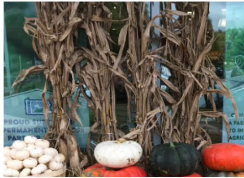
04945 CORN STALKS 1 bunch PLU: Retailer-Assigned