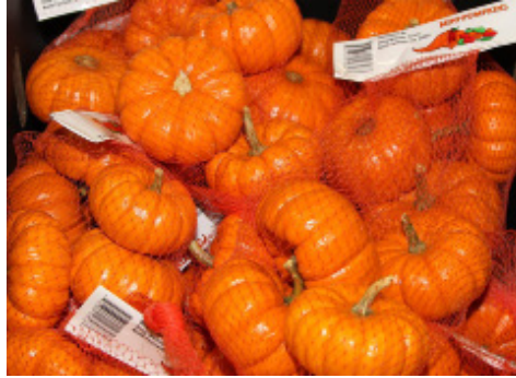
04929 JACK-BE-LITTLES BAGGED 14/5 ct case UPC: 743425-08950