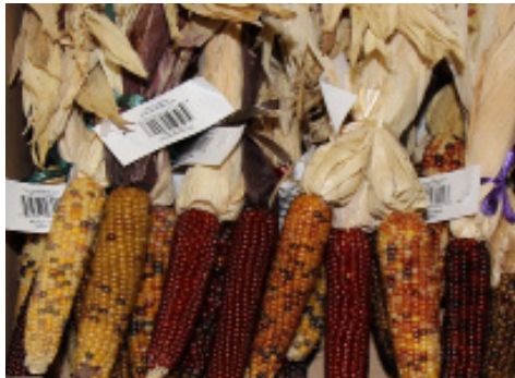
214039 MINI INDIAN CORN Display box 16/3 ct case UPC: 743425-40076