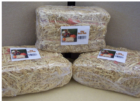
222242 MINI CELLO STRAW BALES 50 ct 21879-20080 *Pre-Order Survey Only*