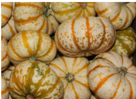
04913 TIGER STRIPE/POKEMON PUMPKINS 20 ct case PLU: Retailer-Assigned