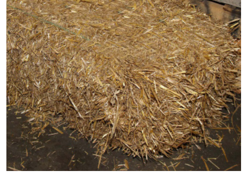
04935 REGULAR SIZE STRAW BALES 1 ct PLU: Retailer-Assigned