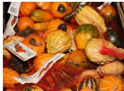
04928 GOURDS BAGGED 145 ct case UPC: 743425-09321