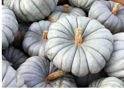
BLUE JARRAHDALÉ PUMPKIN BIN