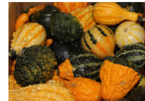
04930 GOURDS 40 ct case PLU: 3135