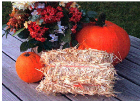
222243 SMALL SINGLE STRAW BALE 24 ct *Pre-Order Survey Only*