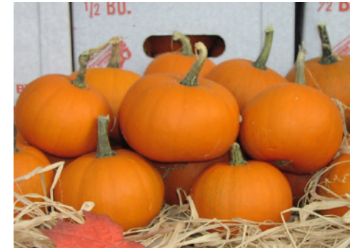
04944 PUMPKIN LITTLES (Hardball size Pumpkin) 20 ct case PLU: Retailer-Assigned