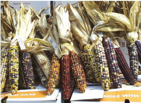
04901 INDIAN CORN 16/3 ct case UPC: 033383-40077