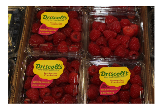
CV RASPBERRIES & BLACKBERRIES

The spot market will be higher on any fruit that may become available and there will be gaps in supply.