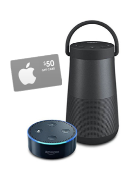
Bose SoundLink Revolve Portable Speaker + Echo Dot + $50 iTunes Gift Card