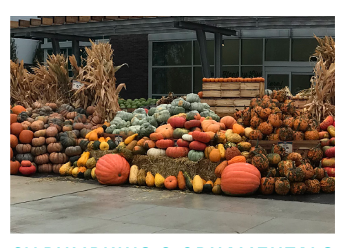
CV PUMPKINS & ORNAMENTALS

Pumpkins and Fall Ornamentals remain in season. The wet weather has created quality concerns at some farms, so attention to quality is important.