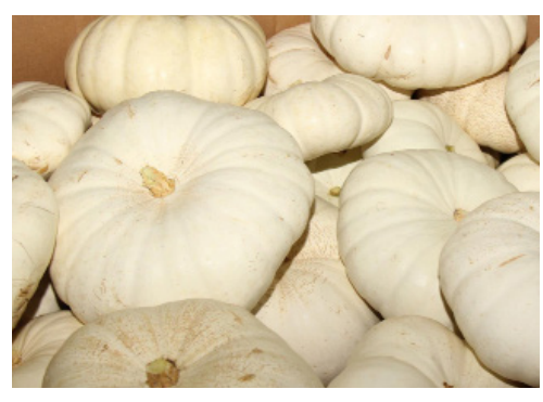
WHITE FLAT PUMPKIN BIN