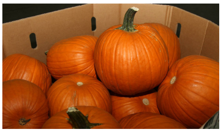
CARVING/JACK-O-LANTERN/FACE PUMPKIN BIN

4984 - CV Pumpkins Face 40 ct bin 4982 - CV Pumpkins Face 50 ct bin