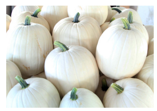
WHITE PUMPKIN BIN