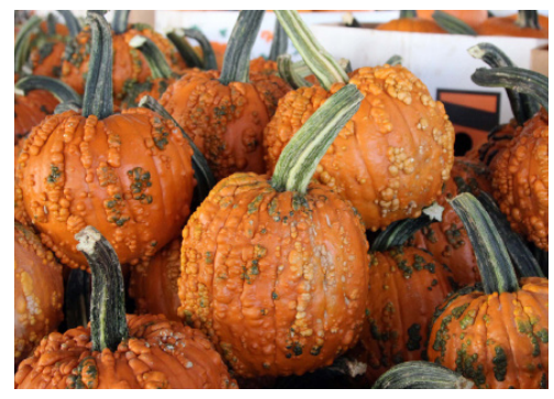
WARTY GOBLIN / KNUCKLEHEAD PUMPKIN BIN