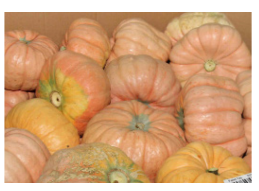
PINK PORCELAIN PUMPKIN BIN