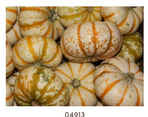
TIGER STRIPE/POKEMON PUMPKINS 20 ct case PLU: Retailer-Assigned