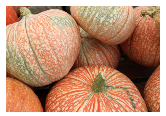
ONE TOO MANY PUMPKIN BIN