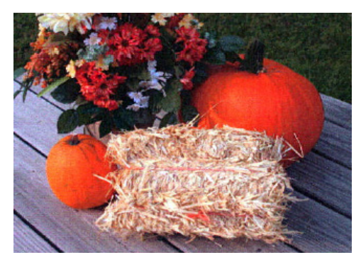
222243 SMALL SINGLE STRAW BALE 24 ct *Pre-Order Survey Only*