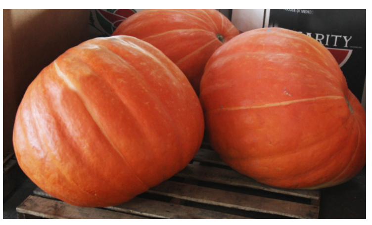
PRIZE WINNER PUMPKINS 4994 - CV Pumpkin Prize Winner 100-170 lb *Available by request*

*Available by request* 4981 - CV Pumpkins Face 30 ct bin 4987 - CV Pumpkins Face 60 ct bin