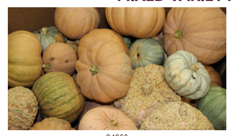
04968 "AUTUMN MIX" PUMPKIN BIN 35 CT (Blue Jarrahdale, Pink Porcelain, Peanut)