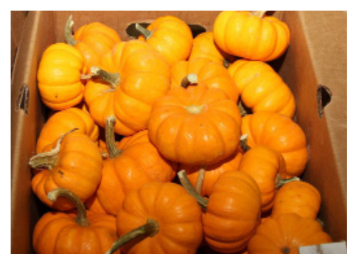
04822 JACK-BE-LITTLE (MINI-PUMPKINS) 40 ct case PLU: 4734