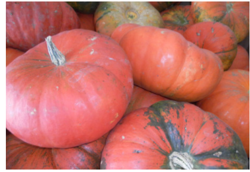
CINDERELLA PUMPKIN BIN