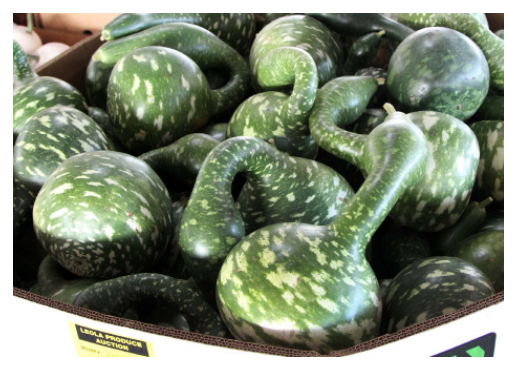
LONG NECK GREEN SQUASH BIN (Goose Gourds)