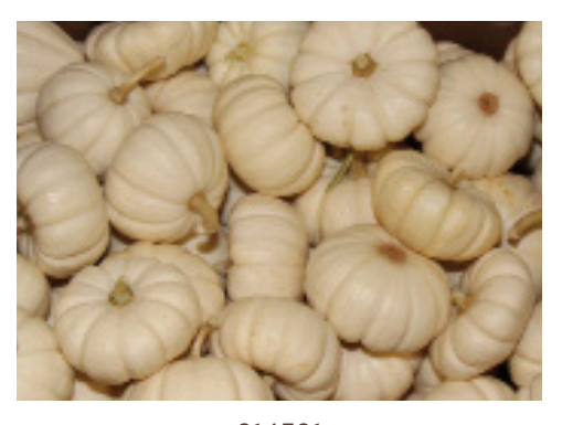
214521 WHITE JACK-BE-LITTLES (BABY BOO) 40 ct case PLU: 4734