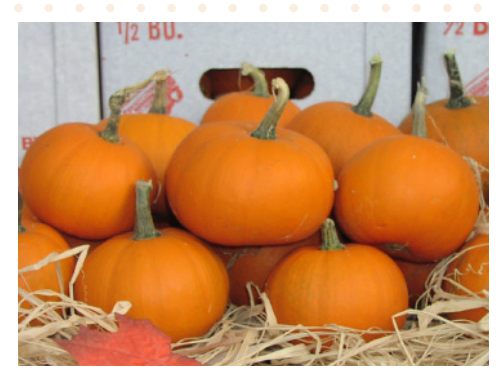
04944 PUMPKIN LITTLES (Hardball size Pumpkin) 20 ct case PLU: Retailer–Assigned