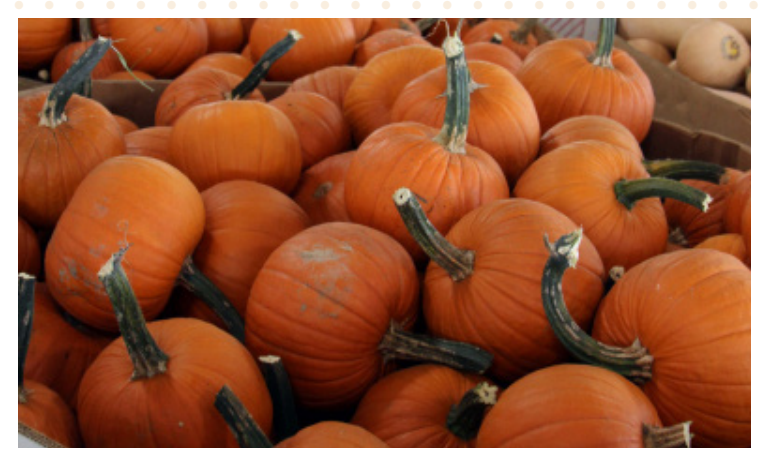
FIELD TRIP/MYSTIC PUMPKINS W/ LONG STEM BIN (For painting or decorating)

7390 - CV Pumpkins Field Trip 140 ct bin *Available by request*