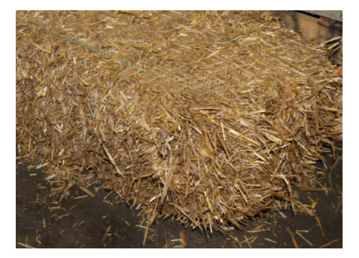
04935 REGULAR SIZE STRAW BALES 1 ct PLU: Retailer-Assigned