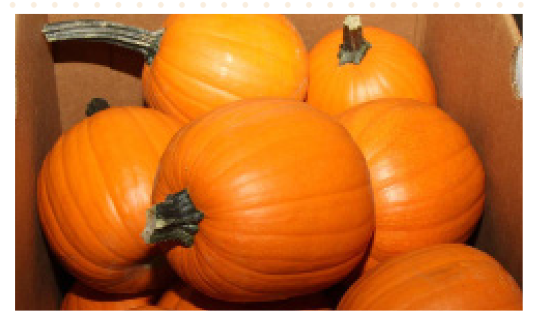
PIE (BABY PAM) PUMPKINS BIN (For baking or decorating)

7390 - CV Pumpkins Field Trip 140 ct bin *Available by request*