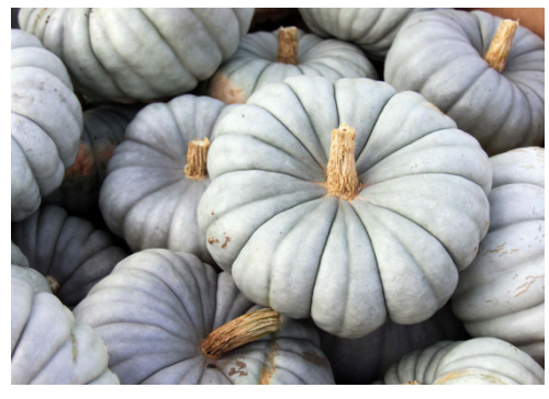
BLUE JARRAHDALE PUMPKIN BIN