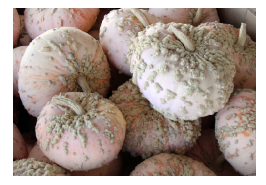
PEANUT PUMPKIN BIN