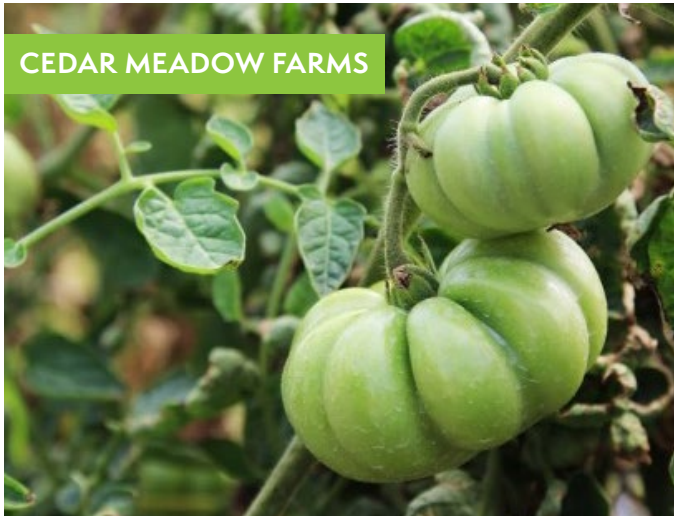
CEDAR MEADOW FARMS