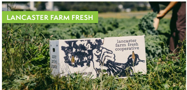
LANCASTER FARM FRESH