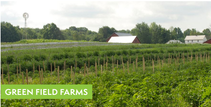
GREEN FIELD FARMS