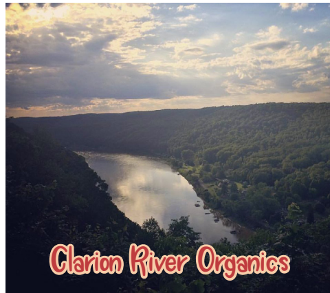
Clarion River Organics