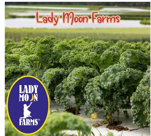
Lady Moon Farms