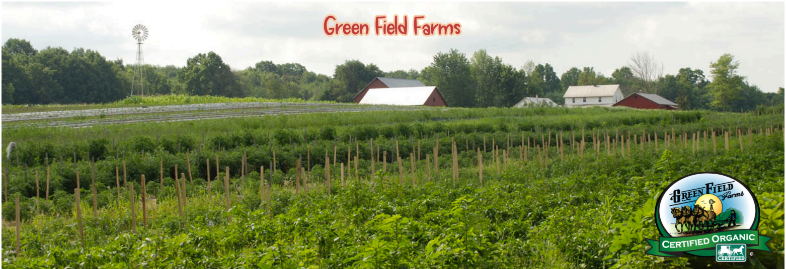
Green Field Farms