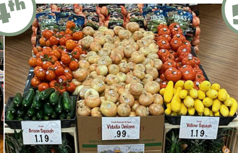
THE BUTCHER SHOPPE Chambersburg, PA