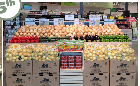
COMMON MARKET Frederick, MD