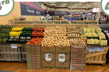
KENNIE'S MARKET Spring Grove, PA