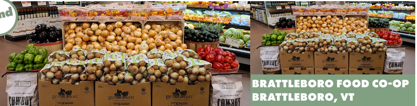
BRATTLEBORO FOOD CO-OP BRATTLEBORO, VT