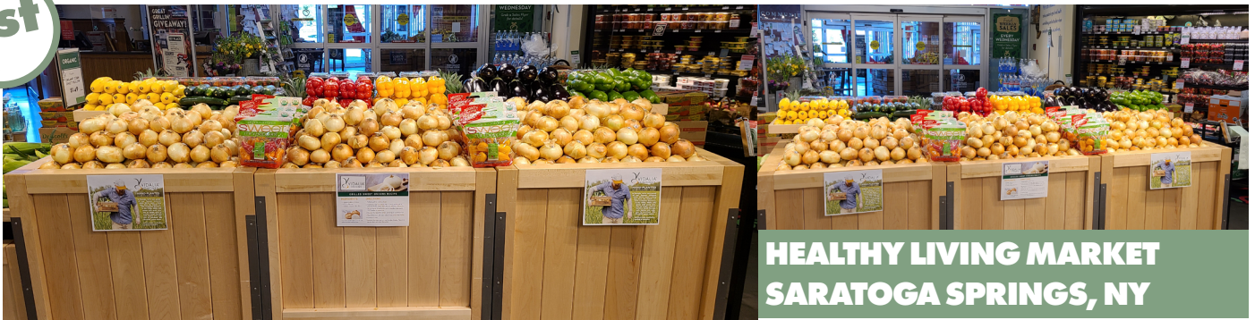
HEALTHY LIVING MARKET SARATOGA SPRINGS, NY