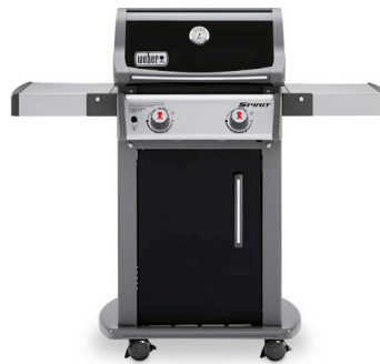
Grand Prize: Weber Grill