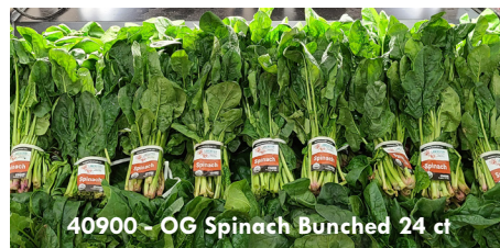
40900 - OG Spinach Bunched 24 ct