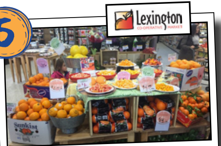
LEXINGTON CO-OP BUFFALO, NY

THANK YOU ALL FOR THE AMAZING ENTRIES WE RECEIVED!