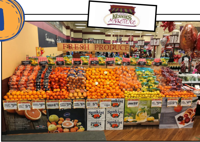
KENNIE'S MARKETS GETTYSBURG, PA