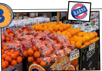
KARN'S FOODS MECHANICSBURG, PA