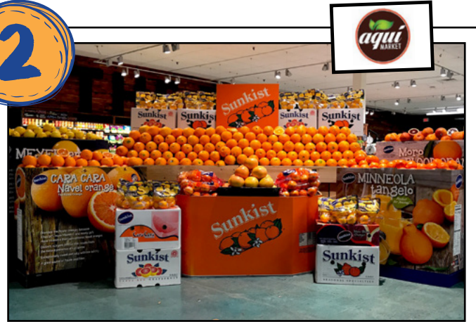
AQUI MARKET CALIFON, NJ