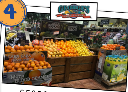
GEORGE'S MARKET DRESHER, PA