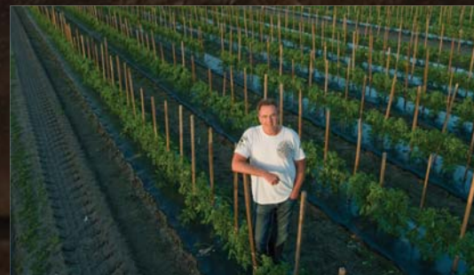
LADY MOON FARMS