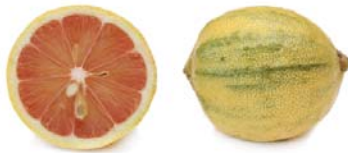
VARIEGATED PINK LEMON