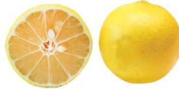
SWEET LIME (PALESTINE LIME)